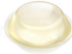
Stand-off I (Short)