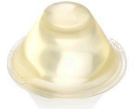
Stand-off II (Long)