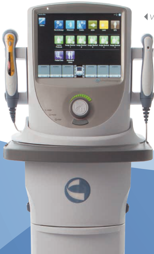
◀ Vectra Neo™ Therapy System